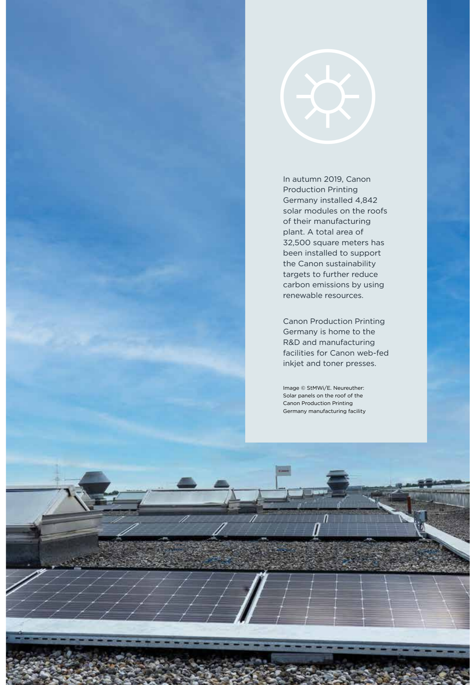
Solar panels on the roof of the Canon Production Printing Germany manufacturing facility

Canon Production Printing Germany is home to the R&D and manufacturing facilities for Canon web-fed inkjet and toner presses.