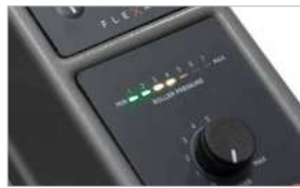
Roller pressure display