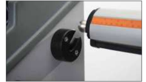
Aluminum shafts with automatic locking system