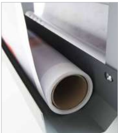
Front tray for prints (optional)