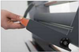
Swing-up steel feed table for quick set-up