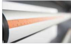
Millimeter scale on each shaft for the right positioning of the media