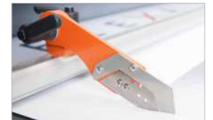
Rear table with cutting unit (optional)