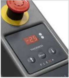
Motorized lifting of the upper roller (optional)