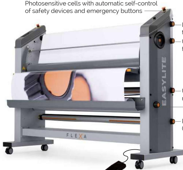
Photosensitive cells with automatic self-control of safety devices and emergency buttons