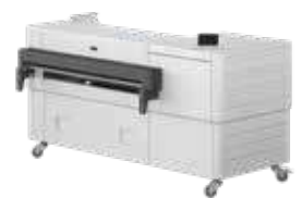
Folder Express 3011