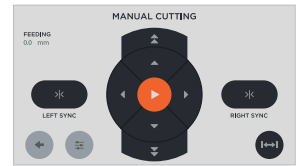
User-friendly software design