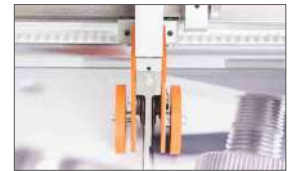
Single lengthwise rotary crush cutter (twin cutters optional)