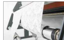
Front rewinding system: it rewinds the cut media up to three smaller rolls (optional for Miura Plus 160)