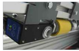
Advanced cutting mark reader