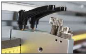
Fine pressure adjustment (according to the types of material)