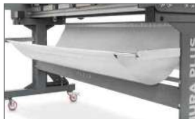
Clean working area thanks to the big waste basket