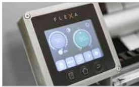
Automatic vertical alignment control panel