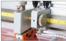
Fine positioning of the cutting blades (optional)