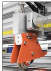
Slimline lengthwise rotary crush cutter, single or twin, (optional)