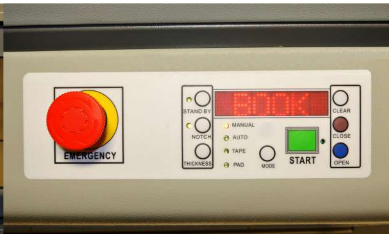
User-friendly control panel