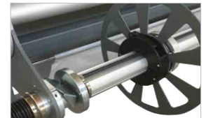
Heavy duty unwinding shaft for rolls Ø 400 mm up to 90 kg weight (optional)