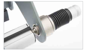
Unwinding shaft brake for adjusting the tension of the material