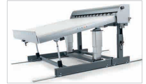
Can be fitted with: (optional): 1. Motorized Stacker in line with the cutter: height and inclination electronically adjustable; extensible length up to 3,2 meters 2. Folding collecting table 3. Tilttable collecting table with wheels