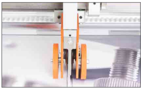
Single lengthwise rotary crush cutter (twin cutters optional)