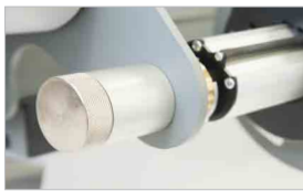
Adjustable unwinding shaft (optional)