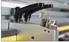
Fine pressure adjustment (according to the types of material)