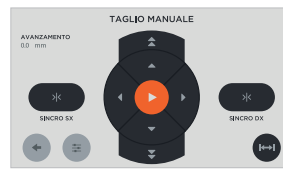
User-friendly software design