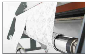
Front rewinding system: it rewinds the cut media up to three smaller rolls (optional for Miura 160)